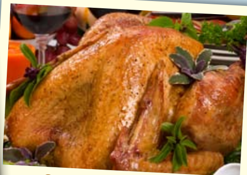
Grapefruit Glazed Turkey

Holiday recipes made luscious with Karo® Corn Syrup and Argo® Corn Starch.