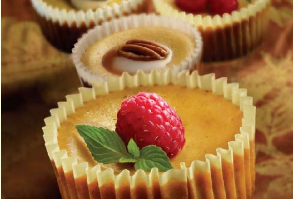
Mini Pumpkin Cheesecakes

Performance. Perfection. Endless Possibilities.